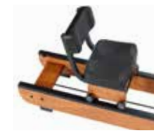
SEAT BACK KIT